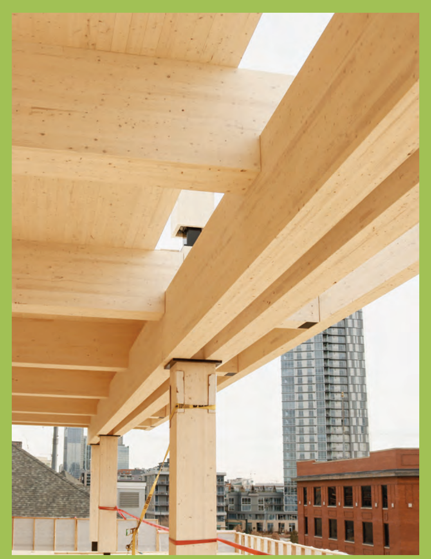
Glulam columns and beams supporting CLT roof panels