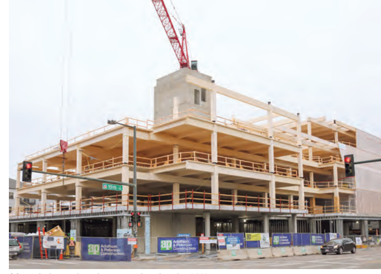
Mass timber reduced construction time by 20%

Material delivery was also important. Just-in-time delivery of the mass timber elements helped with both speed and