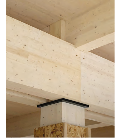
Column connected to CLT beam and girder

Although guidelines related to acoustical performance in office occupancies do exist, they are not requirements under